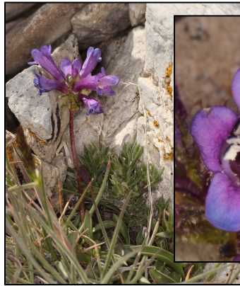
Penstemon heterodoxus var. heterodoxus