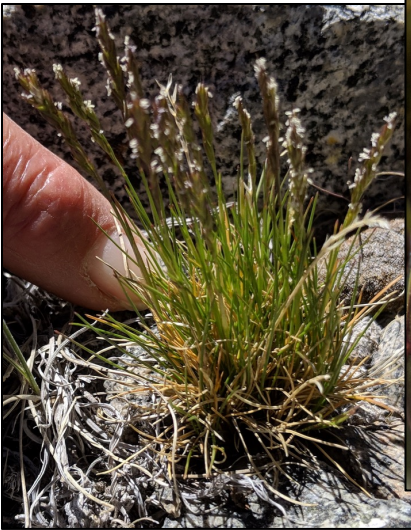
Festuca brachyphylla subsp. breviculmis