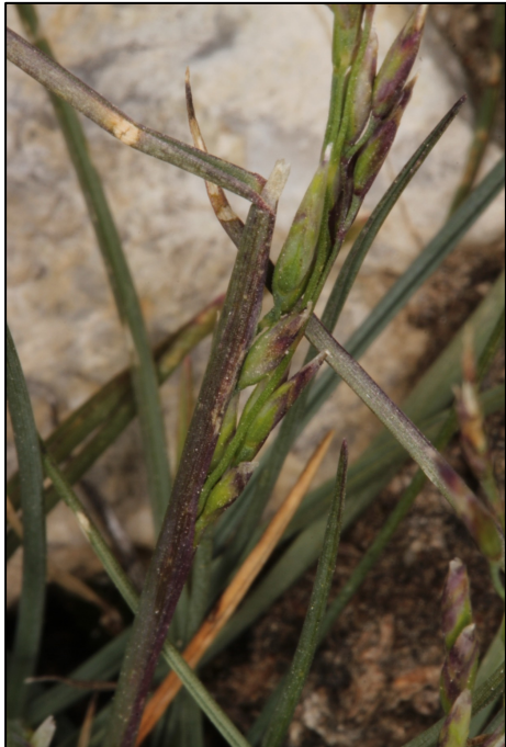
Poa keckii (Only confirmed at CWS)