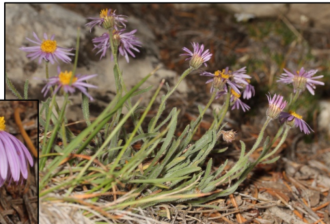
Erigeron clokeyi var. pinzliae