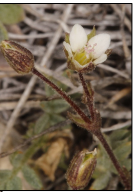
Minuartia nuttallii subsp. gracilis