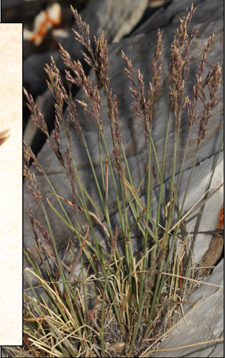
Poa glauca subsp. rupicola