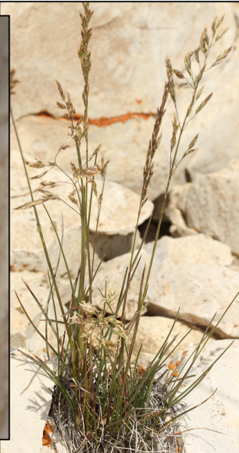
Poa secunda subsp. secunda