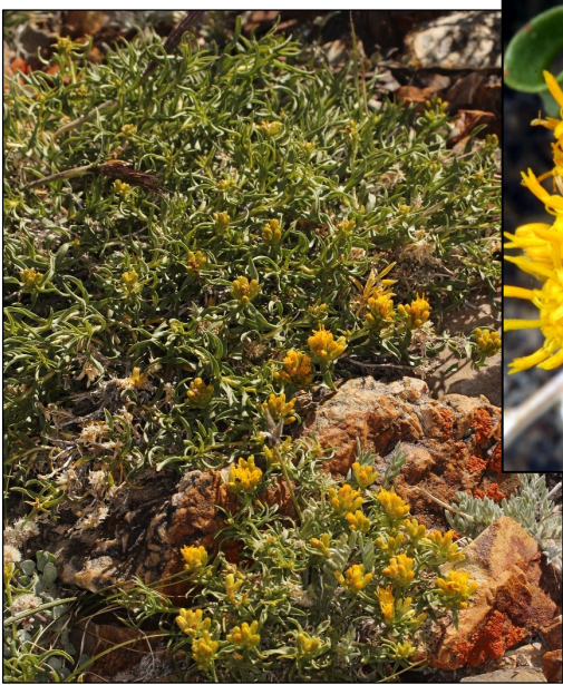
Chrysothamnus viscidiflorus subsp. viscidiflorus