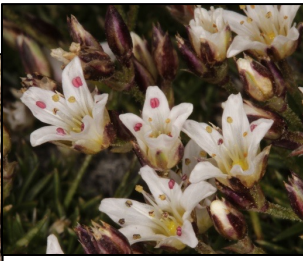
Eremogone kingii var. glabrescens