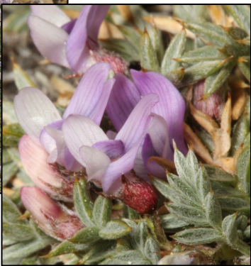
Astragalus kentrophyta var. tegetarius