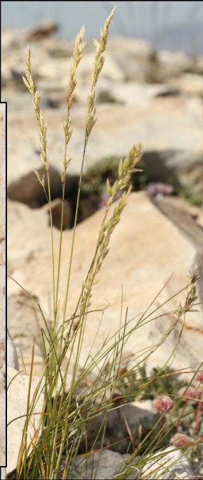
Poa cusickii subsp. epilis