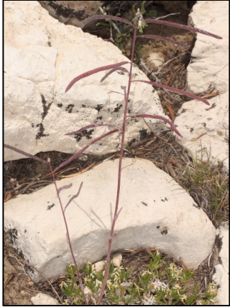
Boechera cf. inyoensis