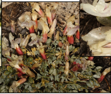
Astragalus calycosus var. calycosus